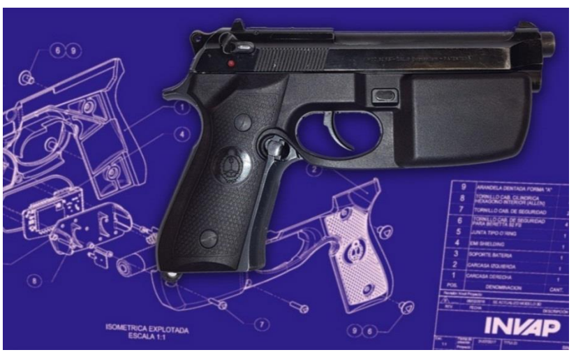
TAG for Beretta 92FS